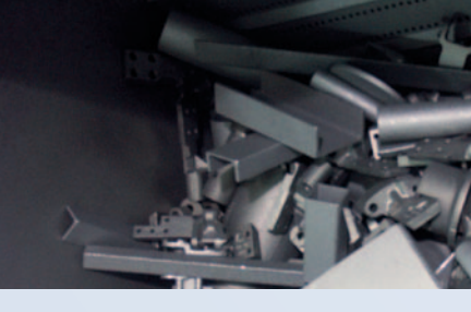
Metal waste after shot blasting