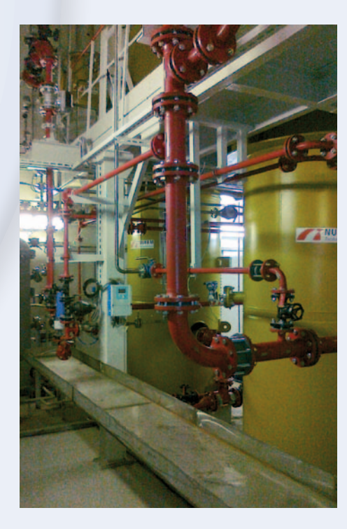
Scrubber, Leningrad nuclear power plant (Russia)