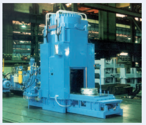
High force compactor, Leningrad nuclear power plant (Russia)